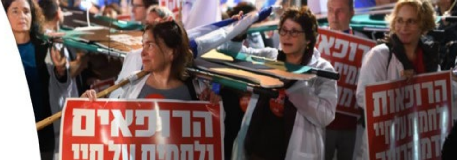
Doctors demonstrating in Israel.